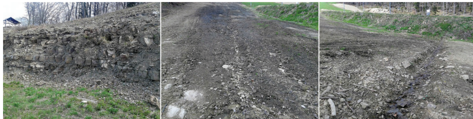
Figure 3. An example of the scope of engineering works and anti-erosion measures performed in the ski slopes areas.

the ski run surface, organic layer distributed on the ski slope surface for faster sodding and the view of a ditch draining the ski slope surface.