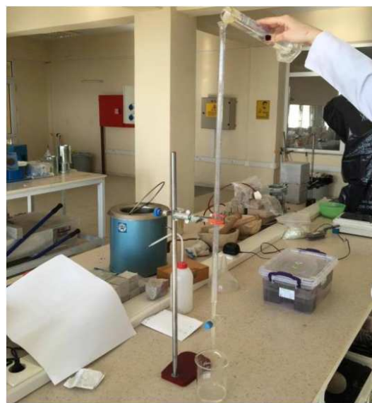
Fig. 1. Implementation of the experiment.

In this work, neutralization of HCl was carried out using NaOH. For this purpose 0.1 M NaOH solution and 0.1 M HCl (from 37% HCl solution) were prepared. 50 ml of 0.1 M HCl solution was then titrated with 0.1 M NaOH. Color change was observed and recorded in the study range of the indicator (phenolphthalein) by increasing the volume of NaOH by 1 ml after the turning point. The implementation of the experiment is given in Fig. 1.