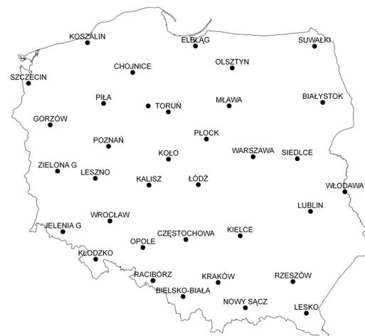
Fig. 3. Location of meteorological stations in Poland for which the SPI is calculated

the previous 10/11 days and forecast for the next 10 and 20 days. The assessment is done in 13 regions distinguished on the basis of diversity of climate and agro-climatic conditions in Poland (Fig. 4). The total area of the selected region under monitoring is 204 000 km 2 .