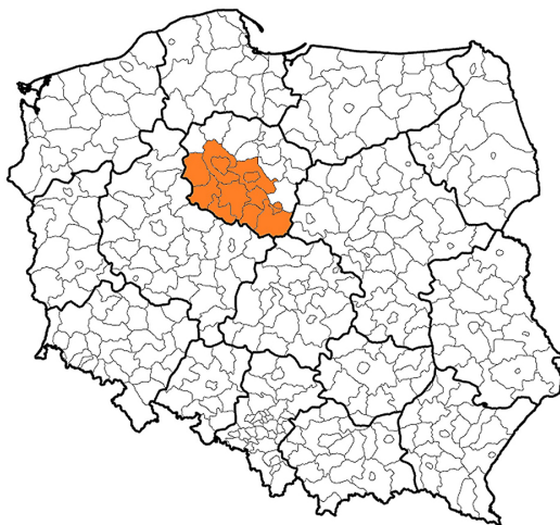
Fig. 1. Location of Kujawy region

The “ Monitoring meteorological and agricultural drought in Kujawy region ” system. The system was developed and operated by the Kujawsko-Pomorski Research Centre of the Institute of Technology and Life Sciences in 2008-2012, in the Kujawy region of central Poland (Fig. 1). The region is the driest region in Poland, where periods of short or long-term drought are very common. The results of the monitoring of meteorological and agricultural drought were presented on the ITP website.