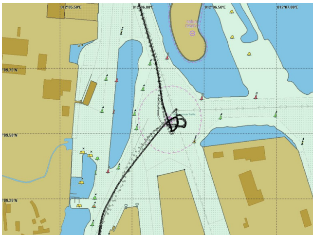
Figure 1. Recorded tracks of real harbour manoeuvres of a ferry

A sample should be given here for the section entitled "Optimized ship handling" where, among others, optimum trim and ballasting but also optimum propeller and propeller inflow considerations and optimal use of rudder and heading control systems are addressed. These items have impact on manoeuvring performance on both the macro (voyage planning in open sea areas) and the micro (manoeuvre planning in coastal areas and harbour basins) planning level and therefore are also relevant for the development of simulation-based training modules of such a training course.