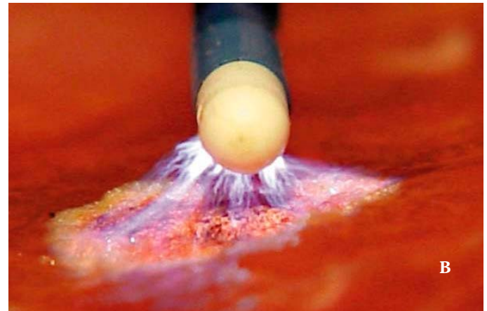
Fig. 1a. i 1b. Endoscopic treatment of dysplasia with HFW (A) and APC (B).