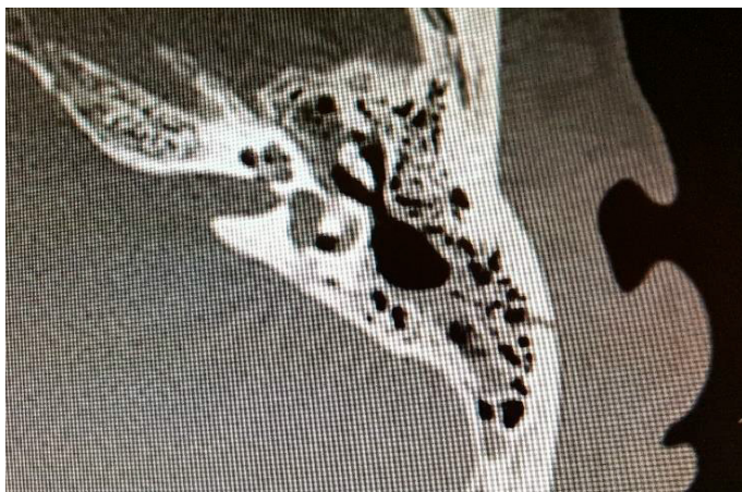
Fig. 1. HRCT scan of the temporal bone – longitudinal fracture of the left temporal bone.