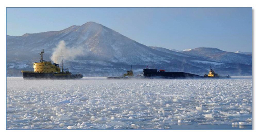
Fig. 4. Russian nuclear submarine "Podolsk" in Arctic.

(SLBM) 'Bulava', will strengthen the maritime force. The Navy is conducting continuously intensive exercise involving all types of combat units e.g. in September 2014 some 10 vessels and submarines (nuclear and diesel powered), supported by Navy Aviation, exercised in the Barents Sea. The focus was on mine warfare, antisubmarine and antisurface warfare employing both submarines and land-based mobile anti-ship missile batteries<sup>77</sup>. The Fleet is also conducting search and rescue exercises with Norwegian armed forces, codename "Barents", to ensure high level of rescue services, which is related to the water and weather conditions in that sea.