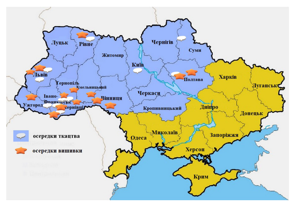
Fig. 2. ICH sites associated with embroidery and carpet weaving (map in English)