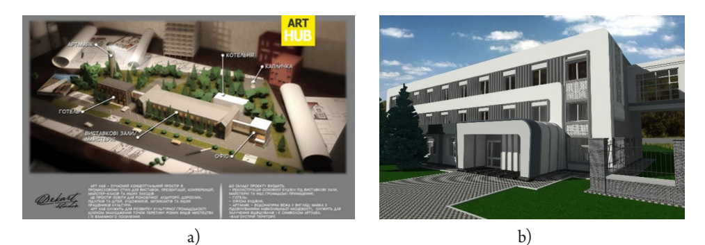
Fig. 4. a) General plan-project of development of the All-Ukrainian Center of Embroidery and Carpet Weaving in Reshetylivka, b) The hotel design

is used for presenting the history of embroidery and carpet weaving crafts and samples of modern crafts products. The center provides education services ranging from master classes to training programs, which are designed as courses lasting several months and as cyclical training. The future AUCECW development project includes the creation of an art hub with an unprecedented exhibition hall, large workshops and a hotel (Fig. 4) (Beznosiuk & Skorostetska, 2020). The center is conveniently located directly at the intersection of international M03 motorway (Kyiv – Poltava – Kharkiv) and the national T1718 motorway (Dnipro – Reshetylivka – Kyiv). Two important ICH sites are located 70-80 km from Reshetylivka: the village of Opishnia in the Poltava region, famous for its ceramics, and the vil-