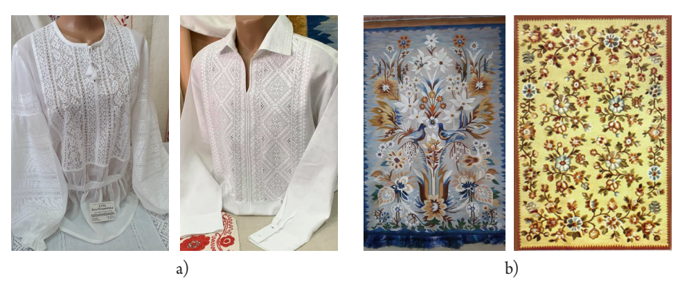
Fig. 3. a) white-on-white embroidery of Reshetylivka, b) traditions of floral carpet weaving

is used for presenting the history of embroidery and carpet weaving crafts and samples of modern crafts products. The center provides education services ranging from master classes to training programs, which are designed as courses lasting several months and as cyclical training. The future AUCECW development project includes the creation of an art hub with an unprecedented exhibition hall, large workshops and a hotel (Fig. 4) (Beznosiuk & Skorostetska, 2020). The center is conveniently located directly at the intersection of international M03 motorway (Kyiv – Poltava – Kharkiv) and the national T1718 motorway (Dnipro – Reshetylivka – Kyiv). Two important ICH sites are located 70-80 km from Reshetylivka: the village of Opishnia in the Poltava region, famous for its ceramics, and the vil-