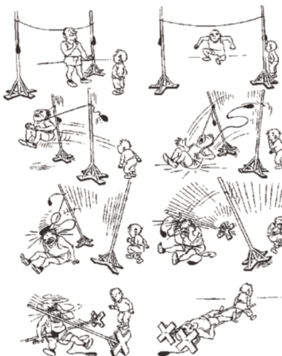
Fig. 1. Black-and-white elements – story pictures

The study took place directly at the school in a separate class and with each student individually. On the computer screen, the verbal and nonverbal stimuli were successively presented to the adolescents. The average duration of the examination of the adolescents was about 20 minutes. On viewing each stimulus, they were asked to fill in a short questionnaire whose questions were about the comprehension of the presented text and picture. In case when the examinee found it difficult to fill out the questionnaire on his own, the psychologist asked leading questions invidually.