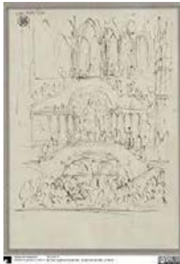
Fig. 4: Karl Friedrich Schinkel: Allegorical representation of science and religion as blessings of peace . Drawing/ Pen/Ink (without year). 282 x 197 mm. Inventory no.: SM 20b. 75.