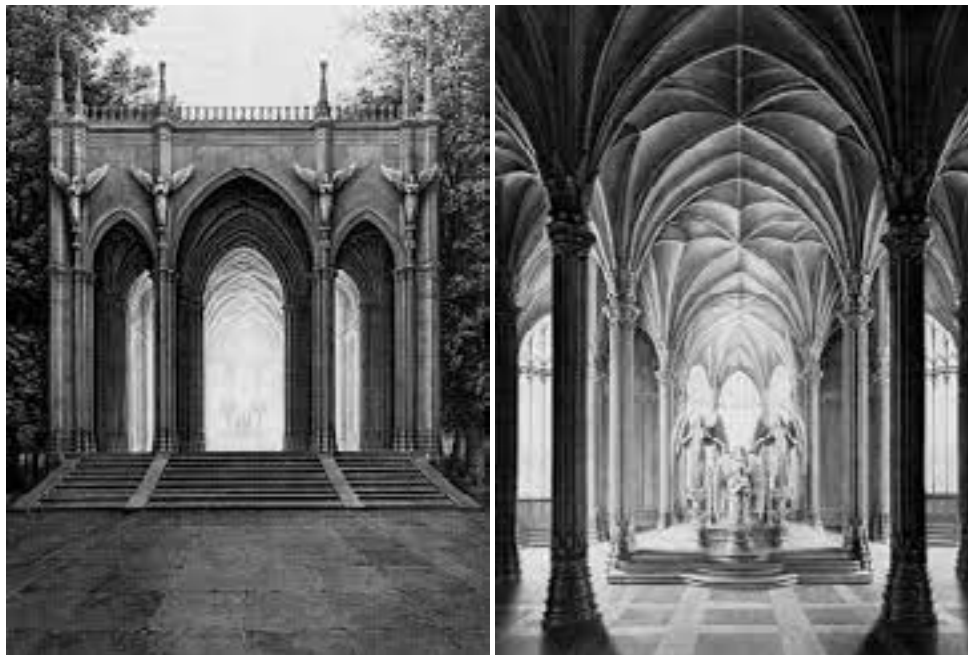
Fig. 1, 2: Karl Friedrich Schinkel: Interior design for the Luisenmausoleum. Drawing/watercolor and opaque colors/ink in gray, watercolor (without year). 72 x 52 cm. Inventory no. SM 54.4. Fig. 2: Karl Friedrich Schinkel: Exterior design for the Luisenmausoleum. Drawing / Brush in gray, wash and watercolor (1810). 71,5 x 54,3 c. Inventory no. SM 54.3.