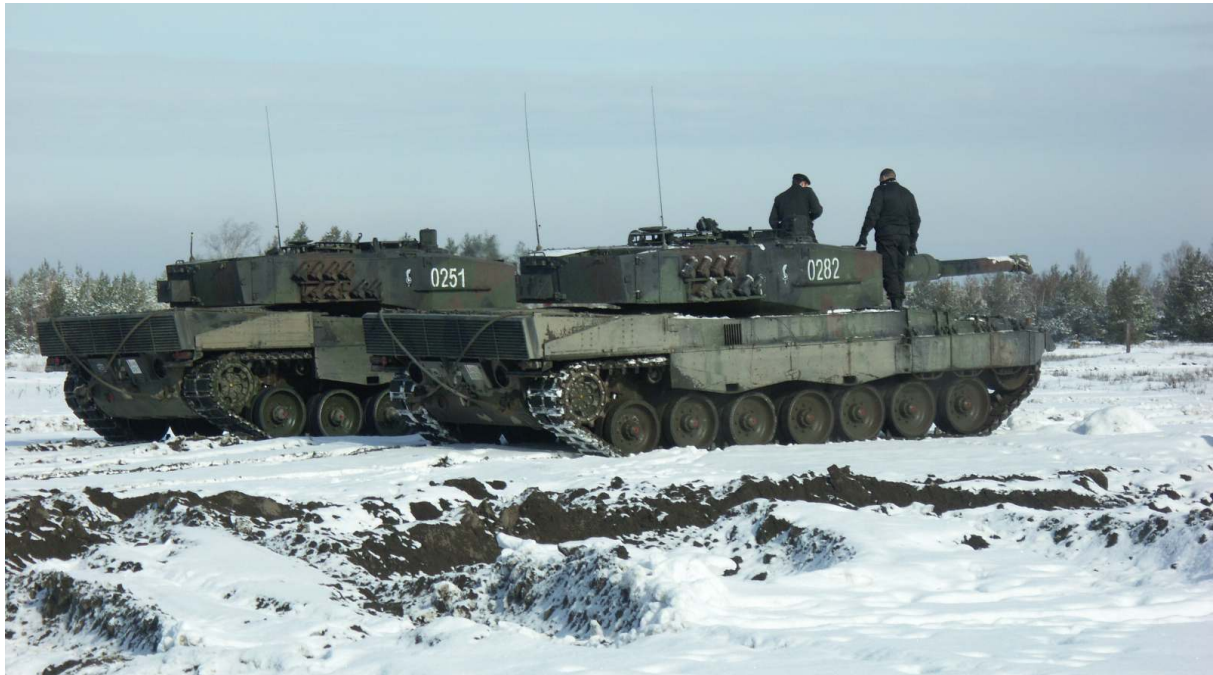
Fig. 1. LEOPARD's 2A4 in service in Polish Land Forces.

Following its experience in the development of the 125 mm combat and training ammunition Military Institute of Armament Technology and BUMAR Group Corporation developed the new family of the 120 mm tank ammunition for polish tanks LEOPARD 2A4.