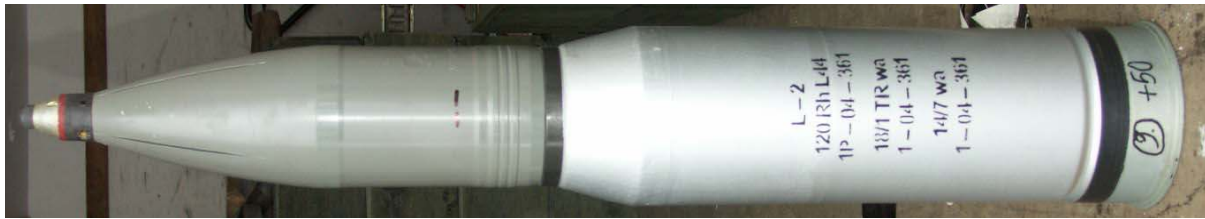
5. Fig. 120 mm HE-TP round.

obturation is achieved by using nylon band. The propellant consists of the powders produced by polish factory.