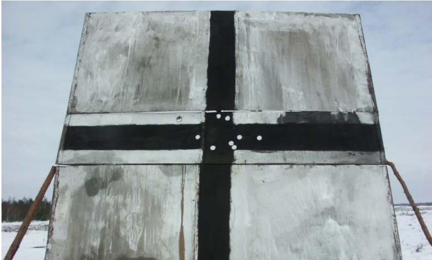
3. Fig. The dispersion of the 120 mm APFSDS-T-TP projectiles at 1000 m.