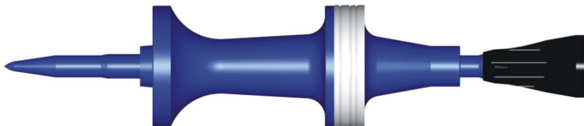
2. Fig. 120 mm APFSDS-T-TP projectile.

The propellant consists of the powders produced by polish factory. For ignition the propellant in all types of 120 mm rounds is used GUW-7 electrical primer. The CCC's for all types of 120 mm rounds are imported from Germany.