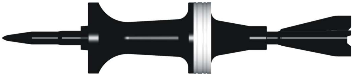
4. Fig. 120 mm APFSDS-T projectile.

The propellant consists of the powders imported from Germany and the powders produced by polish factory. Penetration performance has been certified as 500 mm Rolled Homogenous Armour (RHA) at 2000 m.