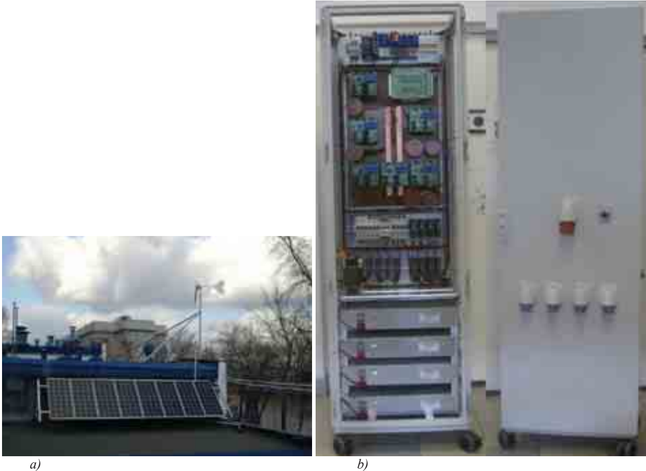
Fig. 2. View of photovoltaic panels (a) and control cubicle (b) of the charging station demonstrator