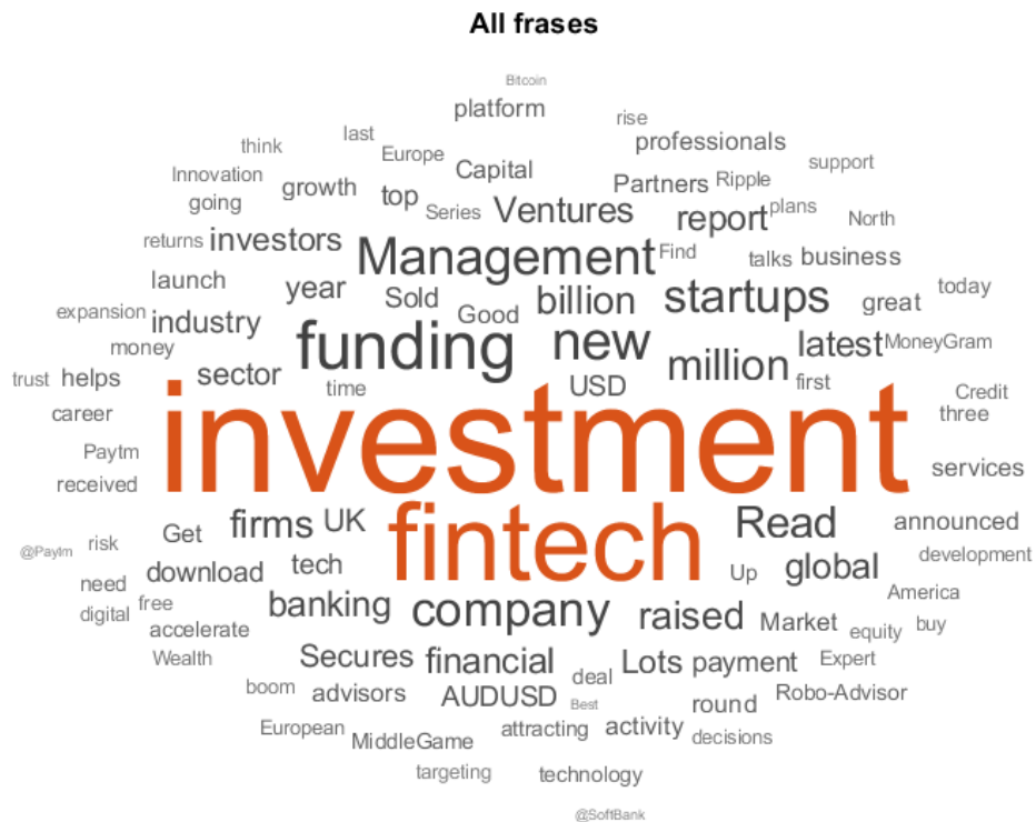
Figure 2: Text analysis using the keyword 'FinTech'