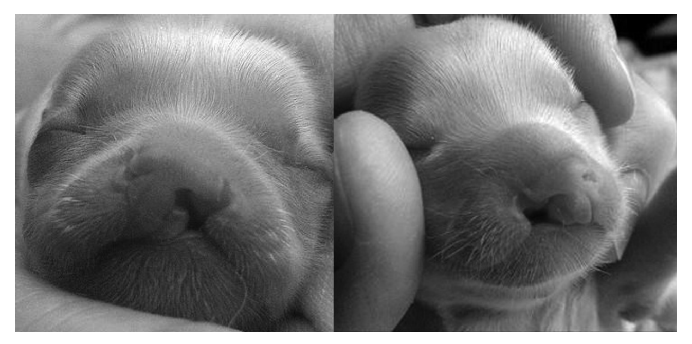
Fig. 3. Cleft of lips and palate in littermate Chihuahua puppies.

caesarean sections were performed 8 times (4 times in Pugs and 4 times in Chihuahuas), whereas, after supplementation it was performed 3 times (2 caesarean sections in Chihuahuas and 1 in Pug).