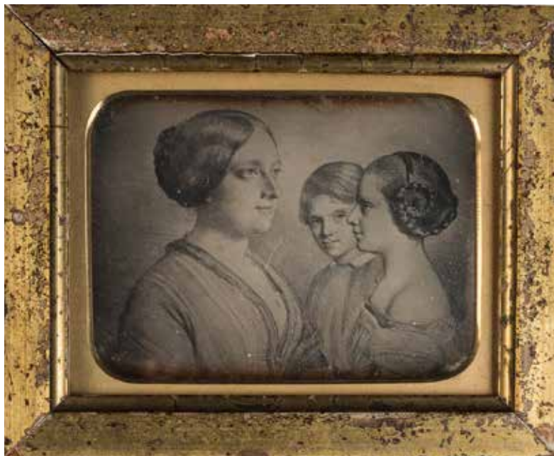
10. Photographer unknown (USA), Daguerreotype of a Pencil Drawing of a Mother with Two Children , c. 1855, daguerreotype in gilt wood frame, 10.4 x 12.9 x 1.5 cm, Collection of Geoffrey Batchen, Oxford

seen from behind as if from another boat (ill. 11). We feel as if we are there. In another daguerreotype, two sulkies charge in from the left of the frame, their large wheels spinning as their horses strain to cross the finish line. In the background is a crowd of people much like us, cheering them on. These two examples are typical in their ordinarieness. The originals were not great prints. They were rudimentary as pictures, popular, cheap. But their repetition as daguerreotypes displaces this question of quality. They are now solid, stolid metal rather than ephemeral paper, and this transformation allows the excitement of the scene they depict to trump their means of depiction. In any case, someone obviously felt these prints were sufficiently engaging to warrant the cost of duplication. This has ensured their survival to the present. And, it has to be said, as reproductive daguerreotypes, they are far more interesting today than the prints they replicate. The copy has turned out to be superior to the original.