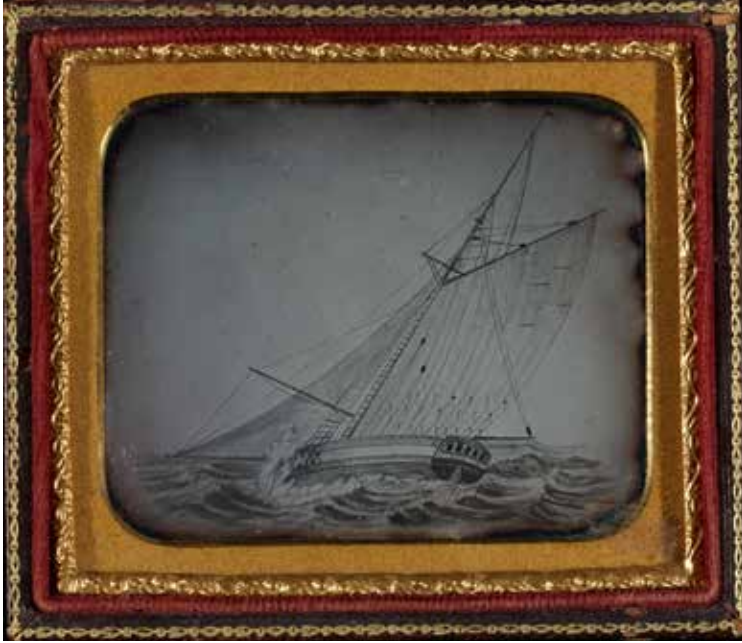
11. Photographer unknown (USA), Daguerreotype of an Engraving of a Sailing Ship, c. 1855, daguerreotype in leather case 8.0 x 9.5 cm

(ill. 12). Beneath these words is a scene showing Jesus teaching an attentive crowd these same words. It's a reminder that they come straight from God (he's saying 'This, then, is how you should pray'). Actually, the particular words reproduced in the daguerreotype were taken from Matthew 6.9–13, and therefore ask God to 'forgive us our debts, as we also have forgiven our debtors'. It's a version that perhaps appealed to an American sensibility keenly attuned to the moral dilemmas of mercantile life. This was a modern version of the prayer, complete with the doxology, the final sentence giving glory to God, which does not appear in the Bible but was added by early Christian communities. Like a medieval book of hours, this daguerreotype packaged the Lord's Prayer in a leather case capable of being carried around and opened and read whenever necessary. Most Christian adults are made to memorize this prayer, so perhaps this miniature reproduction was meant for children, to encourage that process? Or perhaps this is a modern version of a reliquary, carried as a profession of one's faith rather than as something to be read on a regular basis?