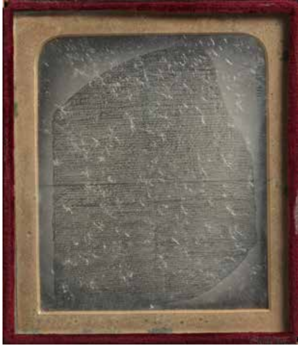
2. John Jabez Edwin Mayall (England), Untitled , [Copy of the Rosetta Stone], 1846-52, daguerreotype (in embossed leather case), 9.0 x 7.6 cm (plate), Collection of Metropolitan Museum of Art, New York

Of course, resembling something is not the same as being identical to it. Most, but not all, reproductive daguerreotypes offer a mirror image of the original picture, an inversion that can only be counteracted by the addition of yet another mirror to the camera during the exposure (or by re-photographing the daguerreotype and thus re-reversing the image). 15 Some examples of this