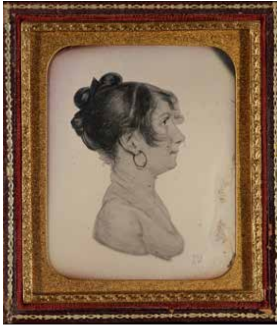
9. Photographer unknown (USA), Daguerreotype of Painted Profile Portrait of a Woman in Circular Earrings , c. 1855, daguerreotype in leather case, 9.3 x 16.2 cm, Collection of Geoffrey Batchen, Oxford

skill as a sketcher while also providing a holistically dimensional facial physiognomy for what we take to be a family group. Most striking is the boy at the back of the composition; he is made to break the fourth wall and look out and directly into the eyes of the viewer. The result is a drawing that provides, in its sense of immediacy and spatial recession, a very 'photographic' experience, an impression reinforced by its transference here to the daguerreotype medium. In this case, the melding of drawing and photograph appears to be seamless, involving both spatial and temporal contiguity. These people look as if they had been caught in an instant before a camera, even though they haven't. It's a masterful illusion.