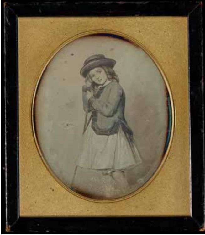
4. Photographer unknown (USA?), Untitled , [ Daguerreotype of a Painting of a Standing Boy in a Hat ], c. 1855, daguerreotype in gold-coloured mat and wood frame, 9.8 x 8.6 cm, Collection of Geoffrey Batchen, Oxford

is thereby reanimated, and given a new interactive life. In similar fashion, a daguerreotype now titled Copy of a Brass Rubbing from the Tomb of Peter de Lacy, Rector of Northfleet and Prebendary of Swerdes, Dublin Cathedral, Ireland offers a chromatically faithful, if miniature, version of the original picture (which is itself an inked impression of a brass tomb relief). The religious value of this impression is reiterated by the exact symmetry of the placement of the image in its brass mat, a mat given an ecclesiastical three-pointed arch at the top and a rectangular notch cut out of its foot to match the shape of the tomb (ill. 5). As a total object, this daguerreotype reproduces not just the image of the tomb but its whole setting. To open its protective leather case is to enter the tomb and enjoy a quasi-sacred experience. It is to enact a resurrection.