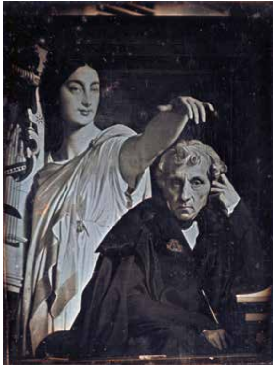
6. Photographer unknown (France), Untitled , [Daguerreotype Copy of Ingres Painting of Maria Luigi Carlo Zenobio Salvatore Cherubini and his Muse ], c. 1843, daguerreotype, 10.1 x 7.6 cm, Collection of J. Paul Getty Museum, Los Angeles

We have another photograph of a painting by Ingres, a quarter-plate daguerreotype said by some to have been taken in late 1841, when the painting was only recently finished (ill. 6). 20 That date would make it a remarkably successful photograph, given how primitive the medium still was at the time.