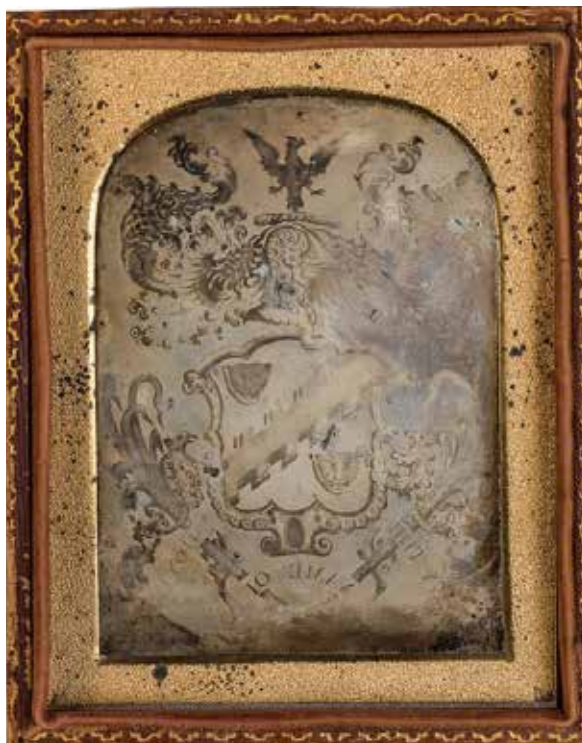
13. Photographer unknown (USA), Daguerreotype of a Certificate with Heraldic Emblem [Bearing the Inverted Words "In the Name of Hoyt"] , c. 1855, daguerreotype in half leather case, 12.1 x 9.6 cm, Collection of Geoffrey Batchen, Oxford

reproduction is the aura of the work of art'. 31 The meaning of this aphorism is a matter of debate. But let's agree that his concern is with a transformation of our relationship to a work of art when its image is circulated in a multitude of reproductions. That concern is fraught with contradictions. Taking aura to be a synonym for authenticity, Amy Powell summarises one of those contradictions as follows: 'Reproduction, then, does double duty: it strikes a blow against authenticity at the same time that, in tandem with the passage of time, it brings that authenticity into being'. 32 What happens to the authenticity of a work of art, then, when that reproduction happens to be