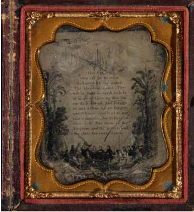
12. Photographer unknown (USA), Daguerreotype of an Engraving of the Lord's Prayer , c. 1855, daguerreotype in leather case, 9.0 x 8.0 cm, Collection of Geoffrey Batchen, Oxford

in a mirror, spell out 'in the name of Hoyt'? (ill. 13). What an odd kind of object! It seems to undermine the very fidelity to appearance for which photography is so valued. As we've seen, paintings can still be appreciated, even when reversed. But a certificate bearing words becomes illegible when daguerreotyped in this way. Perhaps then, the exact meaning of the words did not matter? Could this have been a convenient form of advertisement, used by a travelling salesperson to show potential clients a desirable certificate onto which their own family name could be inscribed after orders had been placed? Or is this a family record of an important document, a certification of an inherited status for which complete legibility is unnecessary? It is likely that we will never know.