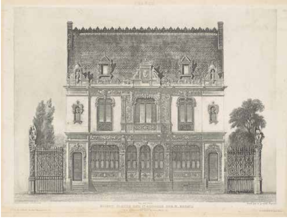
1. Armand-Hippolyte-Louis Fizeau (France), France: Maison élevée rue St. Georges par M. Renaud , c. 1843 ink-on-paper print from engraved and etched daguerreotype of a drawing, from Noël-Marie Paymal Lerebours (France), Excursions daguerriennes, vues et monuments les plus remarquables du globe , vol. 2, Rittner & Goupil, Paris, 1843, 26.0 × 38.0 cm (sheet), Collection of Metropolitan Museum of Art, New York

Of course, photographers have always longed to achieve just such a relationship. Many of the first photographs were contact prints in which an existing picture was placed directly onto a light-sensitive surface, thus facilitating an automatic image transfer from one to the other. 9 In order for daguerreotypy to achieve this same result, the perspectival space promised by its camera must be denied, so that the plane of the picture and that of the photograph can appear to have been similarly coincident. To create this fiction, lighting must be organised to avoid glare or shadow and the camera must be kept exactly parallel to the picture being depicted during the (often lengthy) time of