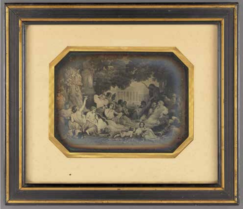
3. Baron Jean Baptiste Louis Gros (France), Untitled , [ Copy Daguerreotype of a Gravure of the Painting by Papety entitled "A Dream of Joy" or "Dream of Happiness" ], 1852-53, daguerreotype in paper mat and wood frame, 14.8 × 20 cm, Collection of J. Paul Getty Museum, Los Angeles

genre offer quite small versions of much larger art works, making details of these works hard to make out in the daguerreotype copy (ill. 3). However, the tonal subtleties, general massing of form and compositional innovations