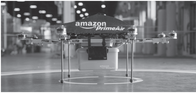
Fig. 1. Amazon.com's drone 'Prime Air' [8]