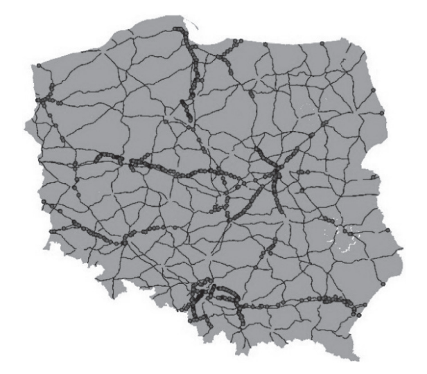
Fig. 3. Coverage of viaToll system on national roads in Poland [own study based on GDDKiA data]

Other devices related to ITS services are the viaTOLL gates. They are part of an electronic toll collection system that is in force on selected Polish roads [7].