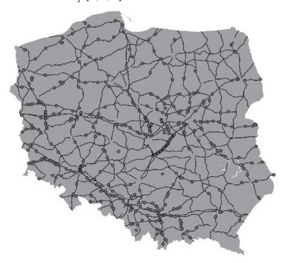
Fig. 2. Weather stations coverage on national roads in Poland [own study based on GDDKiA data]

Devices within this module are divided into 8 categories: A (collecting data about the road surface and weather conditions for traffic management, road maintenance, supervision of road maintenance) - 462 devices, B (for early warning of glazed frost in characteristic points) – 42 devices, C (for automatic prevention of glazed frost) – no devices, D (dedicated to bridges for traffic management, maintenance) - 5 devices, E (warnings about sudden visibility decrease) - no devices, F (traffic management - information about the obstruction of traffic due to the flooding of the road) - no devices, G (taking action in the field of road maintenance due to high water levels in reservoirs and water courses) - no devices, H (mobile meteo stations). 74% of all equipment needs to be modernized to standard functionality [2, 4, 6].