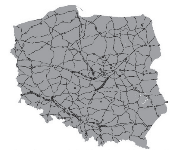
Fig. 1. VMS coverage on national roads in Poland [own study based on GDDKiA data]

Locations with the largest concentration of this module devices are: A4 motorway (Zgorzelec – Brzesko section), A1 and A2 motorways in Łódź branch, S8 express road (Piotrków Trybunalski – Rawa Mazowiecka section), S7 express road in Kraków branch [Fig. 1].