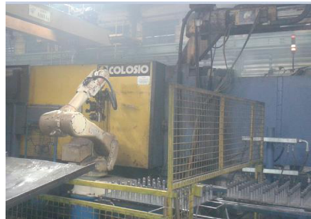
Fig. 3. Colosio PF01000 with robot Kawasaki [13].

functions by the type of menu, software aimed at pressure outflow, Fig. 3.