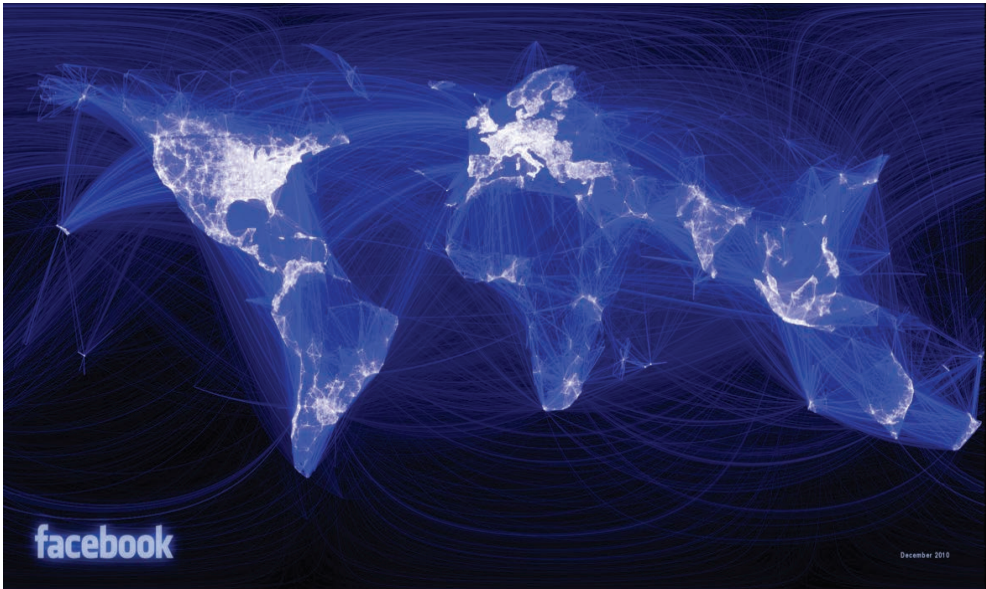
Figure 1. Facebook friendships as visualized by Paul Butler

Figure 1 presents visualization of Facebook friendships as it was created by Paul Butler in 2010 while Figure 2 provides information on days of week that posts and comments are happening on Facebook.