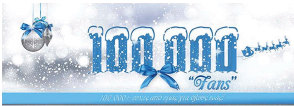
Figure 3. Cover image on Facebook of a small and medium-sized enterprise celebrating New Year's Eve

The creation of cover photos and images where the company shows its gratitude towards its fans consists of another way to engage consumers to the community social media may create. It is typical that a Greek small and medium-sized company communicated with its customers and created a fan photo for New Year in 2014 on Facebook, including the number of its 100,000 fans—which is a big number of social media fans for a company (Figure 3). Interactivity exists and organizations may well take that into consideration.