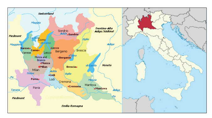
Figure 1. Lombardy region, northern Italy.

The first group (n=103) consisted of 47 cow breeders, 31 pig breeders, 11 fish breeders, and 14 non- breeders who were