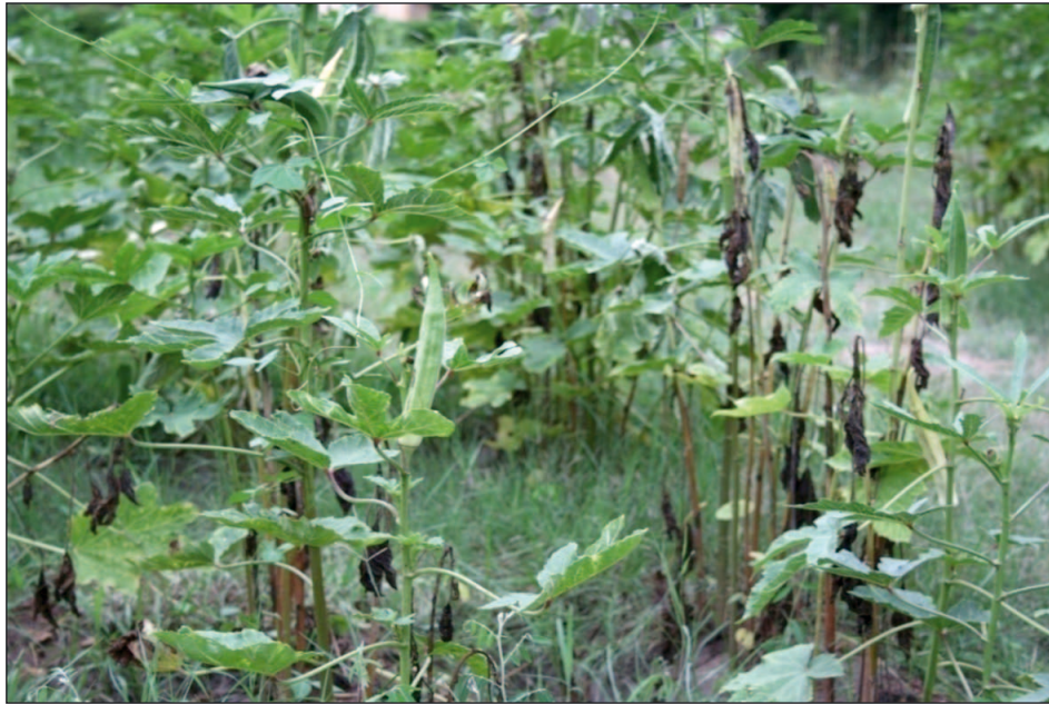
Fig. 1. Okra field infected with Fusarium and Phytophthora

tacks a wide variety of vegetables, fruits, grains and floral crops. It may remain viable for 10 years or more in soil (Baysal-Gurel et al. 2012). It is difficult to estimate yield losses due to Phytophthora diseases since the same species may cause a number of other diseases, in different environmental conditions, particularly rainfall and humidity, can have a dramatic effect on disease incidence and severity (Benson et al. 2006). Most Phytophthora -related losses can be attributed to Phytophthora pod rot (PPR) followed by stem cankers. It is commonly estimated that 10–20% of the world's annual production is lost due to PPR, but estimates vary from average annual losses of 10% up to 30%, with much higher losses in particularly wet locations or during wet years (Erwin and Ribeiro 2006). In Western Samoa, losses of 60–80% due to PPR in wet years were reported by Keane (1992).