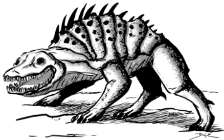
Fig. 1. The sketch of massif

The deserts found in the Star Wars Universe were, similarly to Earth's desert, inhabited by various reptile species. This group of animals is well adapted to the harsh environment. The body of desert reptiles, such as lizards, snakes, and turtles, is covered with hard and dry scales and scutes, which form a tight isolation layer and reduce water loss through evaporation. It has been shown that the speed of body evaporation is over 20 times higher in the case of cayman inhabiting water environment in comparison to desert turtle. Additionally, reptiles excrete nitrogenous waste in uric acid and not urea. This form of excretion requires a smaller amount of water 4 . Interestingly, in contrast to Earth, some of the reptiles found on Star Wars planets were characterized by considerable body size. This could be observed on the example of rontos and dewbacks, which were used for riding and transports of loads. Another interesting example of a domesticated reptile were dogs resembling mastiffs used for guarding. In contrast to other reptiles, these animals were swift fast and agile.