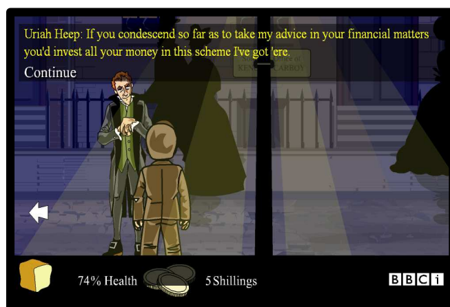
Figure 2. Surviving Charles Dickens' London Game