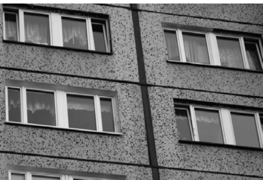
Figure 1. Main places in panel buildings where swifts build nests: ventilation holes in attics (left) and crevices between panels (right)